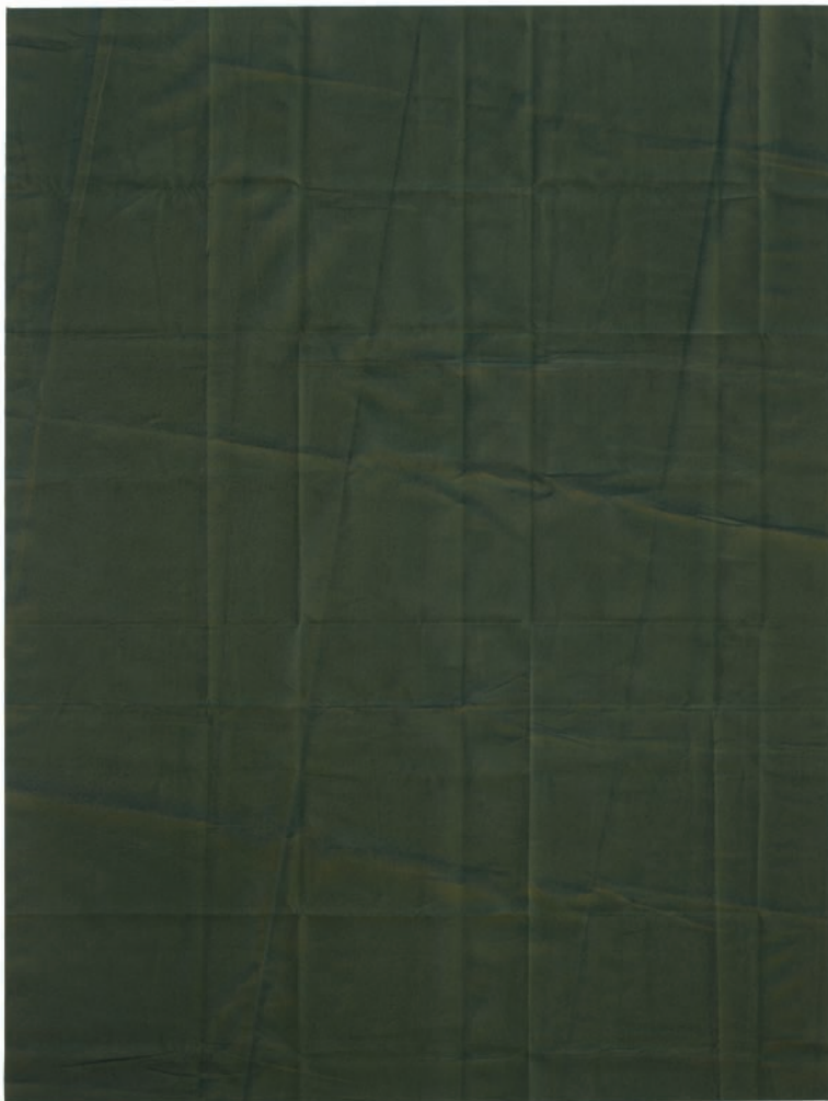
Tauba Auerbach, Untitled Fold Painting III , 2009, acrylic on canvas, 80 x 60".

The third relationship is one in which the grid itself is the opposition to gravity. In this broader case, the definition of grid should be expanded, as it is in Grid Index , to include tilings—coverings of the plane in which there is no excess of space or overlap between constituent shapes. The entropic event of ice melting, for instance, sets geometric tiling against gravity's pull toward decay and disorder, taking the gridded (albeit inconsistent) crystalline structure and rendering it an amorphous molecular soup. Similarly, but in the reverse order, crystal structures grow more consistently and easily in zero gravity—even forming in unlikely substances like plasmas—without their entropic enemy. If gravity is a protagonist in the plot of entropy, then the order of the grid is its natural and valiant, although doomed, antagonist.